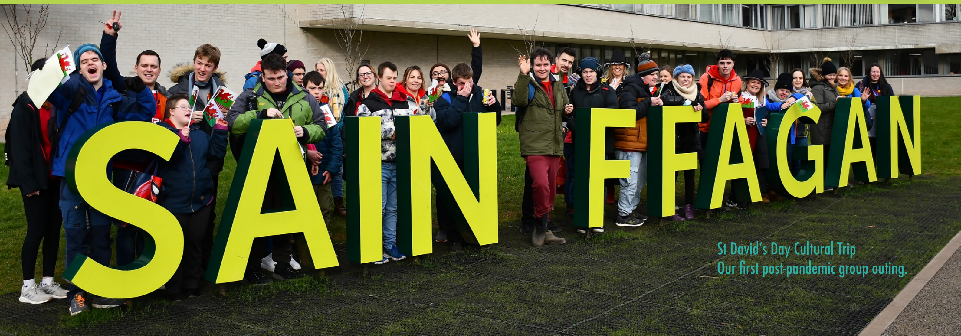
St David's Day Cultural Trip Our first post-pandemic group outing.